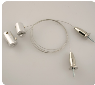
CDAZC10 Side Mounted Cable System C