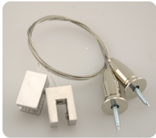
CDAZB10 Top Mounted Cable System B