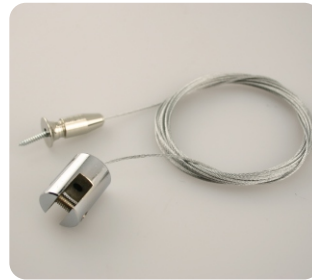
CDAZE10 Top Mounted Cable System E